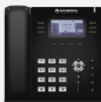
s400 / s405*